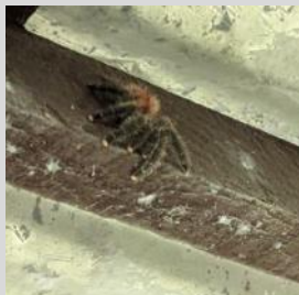
This is definitely NOT one of the students but IS a frequent visitor.