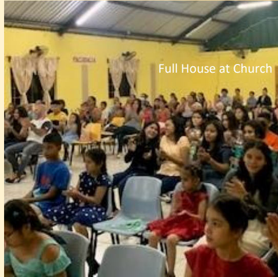
Full House at Church