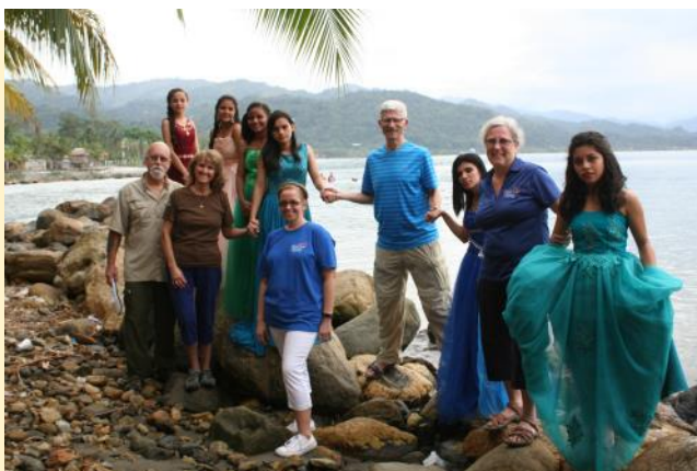
Beauties by the Sea