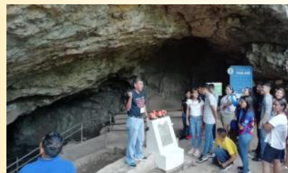
Taulabe Caves Trip

We are grateful to all of you who support Heart to Heart Ministries. Thanks to you, we watched God's miracles happen for our students and staff as we learned about and put into practice the fruits of the spirits.