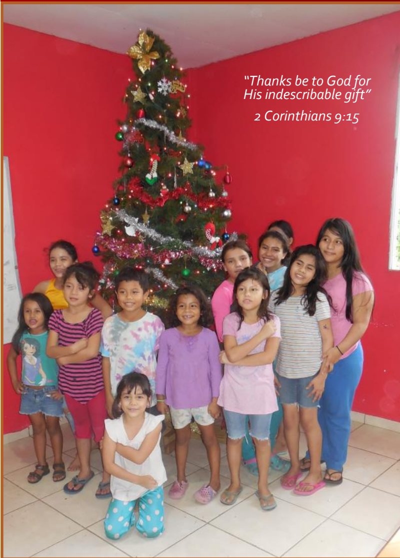
"Thanks be to God for His indescribable gift" 2 Corinthians 9:15