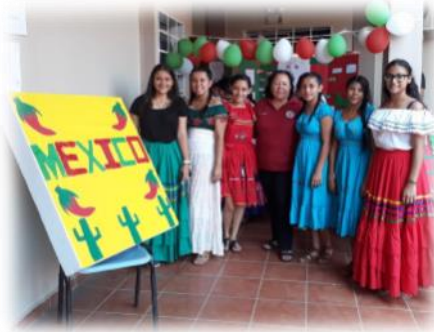
National Spanish Language Day

This month we celebrated National Spanish Language Day at both schools with songs, dances and poetry.