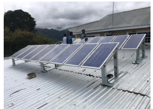
Solar Panels on Boys' House

With this license we can export more coffee to the US for sale in churches, organization, and any other outlets that may be interested in buying it. We will have more information soon about how your organization could support H2H in this endeavor.