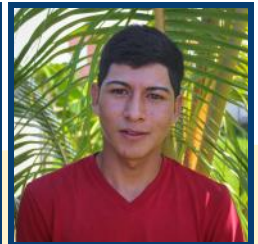
Elder - Age 19