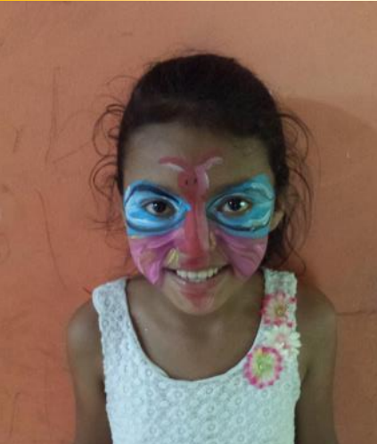
Can you guess who I am?