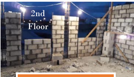
ON IT'S WAY UP!!