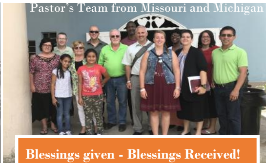
Blessings given - Blessings Received!