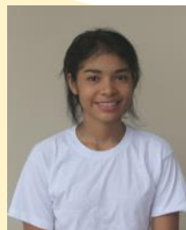
Olaga - 21