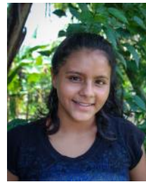
Idalmi - 15