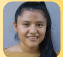
Osiris - Age 15