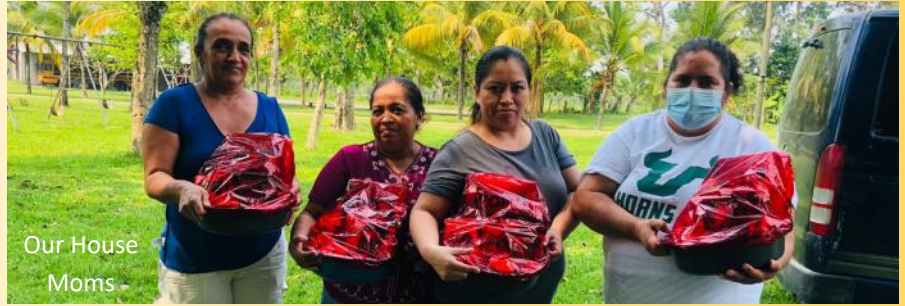
Our House Moms