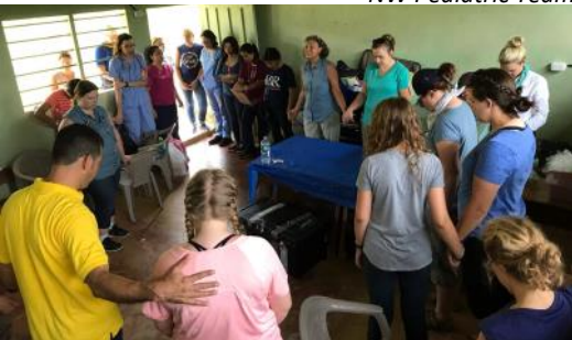
NW Pediatric Team